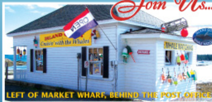
LEFT OF MARKET WHARF, BEHIND THE POST OFFICE

"By rare chance IF NO WHALE YOU SEE, COME CRUISE AGAIN FOR FREE!" (Seasonal).