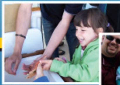
ONBOARD TOUCH TANK

"ISLAND QUEST MARINE ADHERES TO THE BAY OF FUNDY WHALE-WATCHERS CODE OF ETHICS"